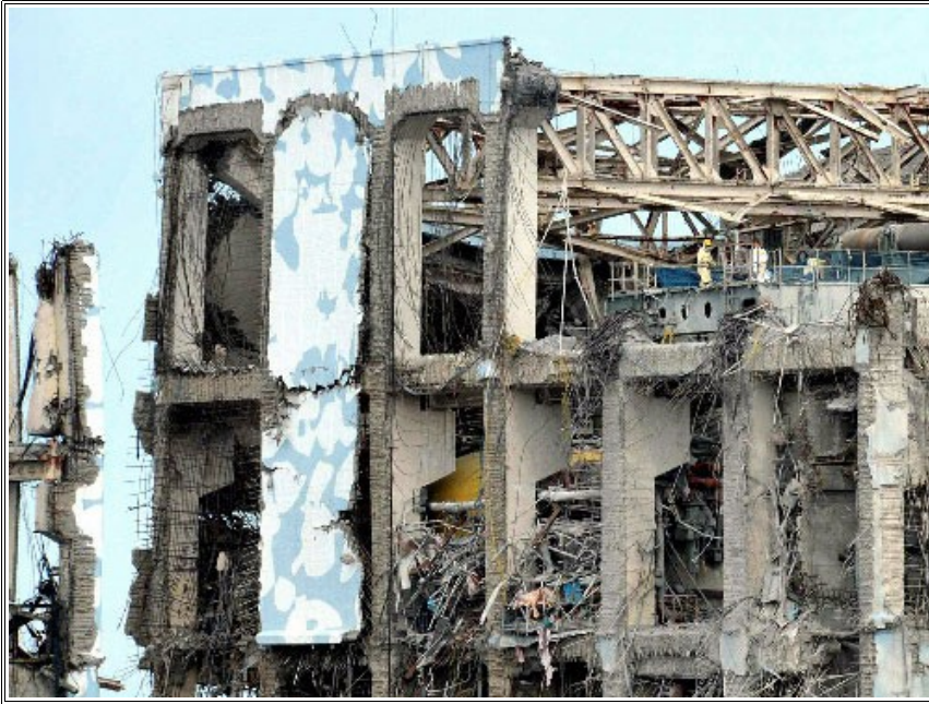
Fukushima Reactor #4 showing exposed Fuel Pool perched 100 feet above ground